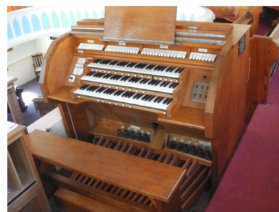
The console of Newbury Methodist Church

Reinstatement of organ after major building refurbishment. Bellows releathered, Swell and Great and Pedal primary actions remade, new Choir slide solenoids. Console refitted, new thumb pistons, solid state switching and piston action. Hunter 1898, rebuilt 1963 by Gray & Davison. 3 manual 36 stops.