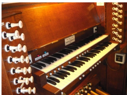
The console of St Monica's, Palmers Green

Hill Norman & Beard 1924. 2 manuals 20 stops.